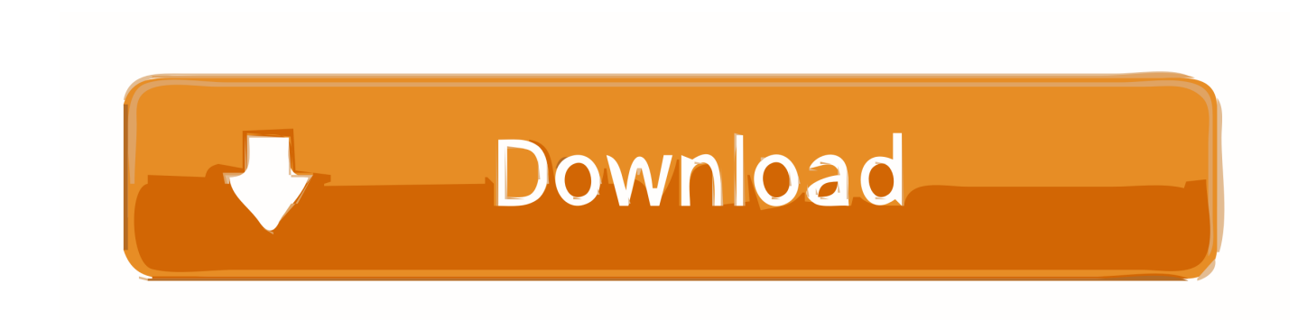
Jdk 1.6 For Mac Free Download